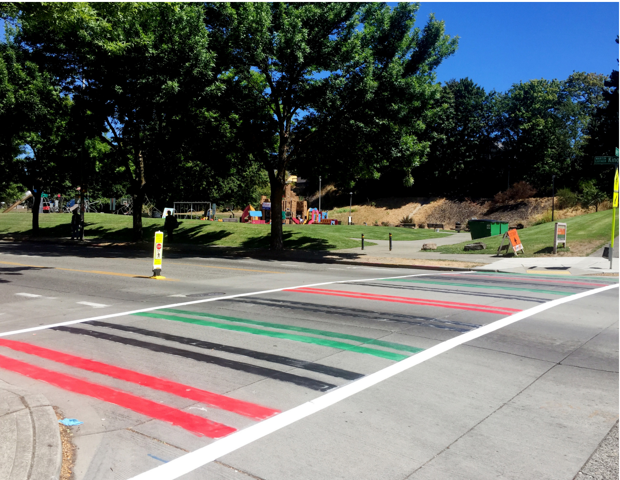
CENTRAL DISTRICT ON MLK JR WAY PAN-AFRICAN COLORS