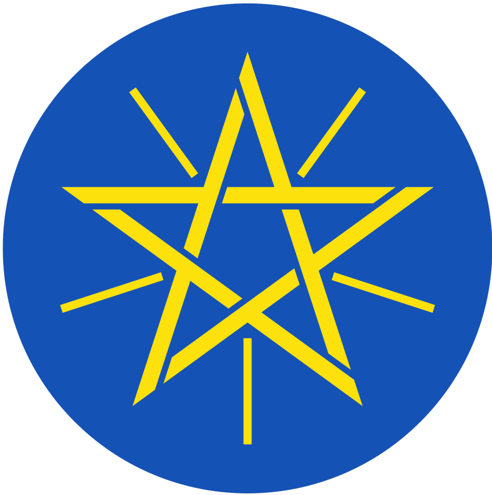
EMBLEM OF ETHIOPIA - POSSIBLE FILL FOR WHITE CIRCLE TO REPRESENT ONE OF THE COMMUNITIES OF COLOR IN THE NEIGHBORHOOD