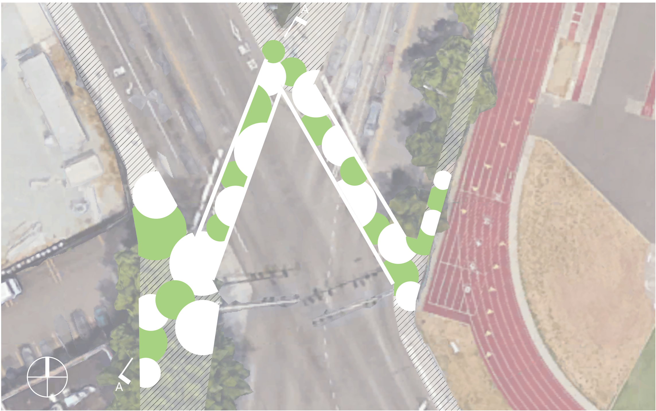
BASE PATTERN - WHITE CIRCLE TO BE FILLED BY COMMUNITY ARTISTS (PROFESSIONAL AND STUDENT)